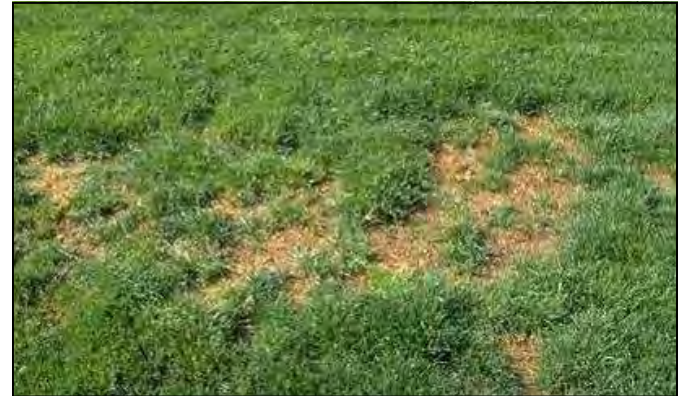
A lawn with characteristic grub damage.