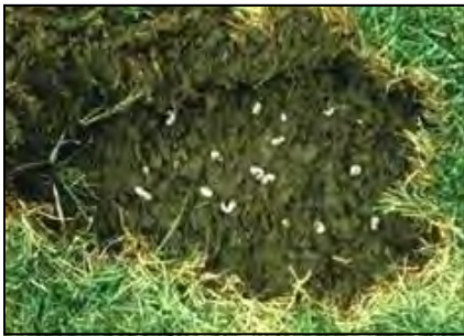
A grub infestation.

Use a shovel to cut a 1 foot by 1 foot square of turf and pull it back. If you count more than 10 grubs in that area then you may have a grub population that is large enough to damage your lawn.